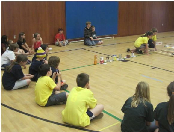
Science Olympiad - Can Car Race

The Pleasant Ridge Union School District was delighted to sponsor the 1st Annual Elementary Science Olympiad for Nevada County. The event took place on the campuses of Magnolia and Cottage Hill Schools on Saturday, May 7. Eleven teams from Scotten, Alta Sierra, Cottage Hill, Grizzly Hill, Clear Creek, Pleasant Valley and Grass Valley Charter Schools competed in the event. Teams were made up of students in grades 4 th - 6 th .